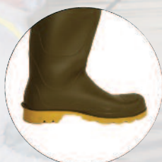
High density yellow soled boot