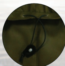
Chest wader internal draw-cord