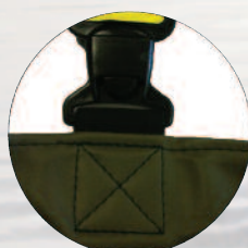
Chest wader box stitch, reinforcement with elasticated brace loop