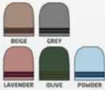
42-0582-45 ACRYLIC BEANIE WITH PEAK